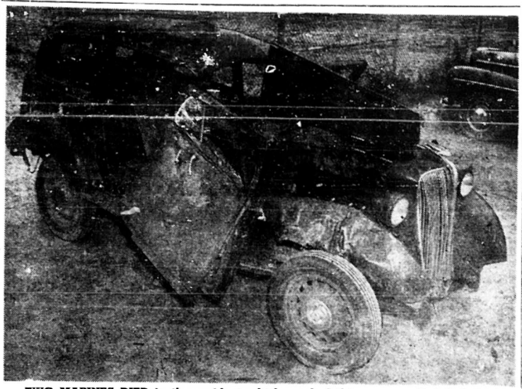
TWO MARINES DIED in the accident which crushed this car near Red Oak, N. C., last Saturday. The heavy damage wat attributed in part to the car's age, which caused a weakening of physical structure, crystallization of glass and general impairment of the vehicle's operating efficiency,