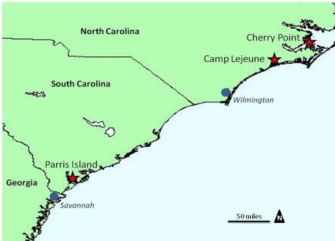
Figure 1. Locations of Parris Island, SC, Camp Lejeune, NC, and Cherry Point, NC.

A team of scientists and engineers from the University of South Carolina Beaufort (USCB) and The Georgia Institute of Technology – Savannah was contracted by the United States (U.S.) Marine Corps to identify and quantify munitions constituents in upland soil, intertidal and bottom sediments, and sea water at three U.S. Marine Corps installations: 1) Marine Corps Recruit Depot (MCRD) Parris Island, 2) Marine Corps Base (MCB) Camp Lejeune, and 3) Marine Corps Air Station (MCAS) Cherry Point (Figure 1). Consistent with the U.S. Marine Corps Range Environmental Vulnerability Assessment (REVA) program, the contractual tasks were designed to determine whether there is a release or substantial threat of a release of munitions constituents from the operational ranges or range complex areas to off-range areas. All three study sites are located in coastal/estuarine environments of the southeastern U.S. Sampling environments ranged from heavily wooded areas to intertidal marsh to coastal river, sound, and bay sites. Areas downrange of small arms firing ranges were the focus at the first two installations. At Cherry Point, munitions constituents resulting from aerial bombing training were of primary interest. This report deals exclusively with sediment and sea water sampling and analysis conducted at MCAS Cherry Point. Separate reports were prepared detailing similar activities at the other two installations.