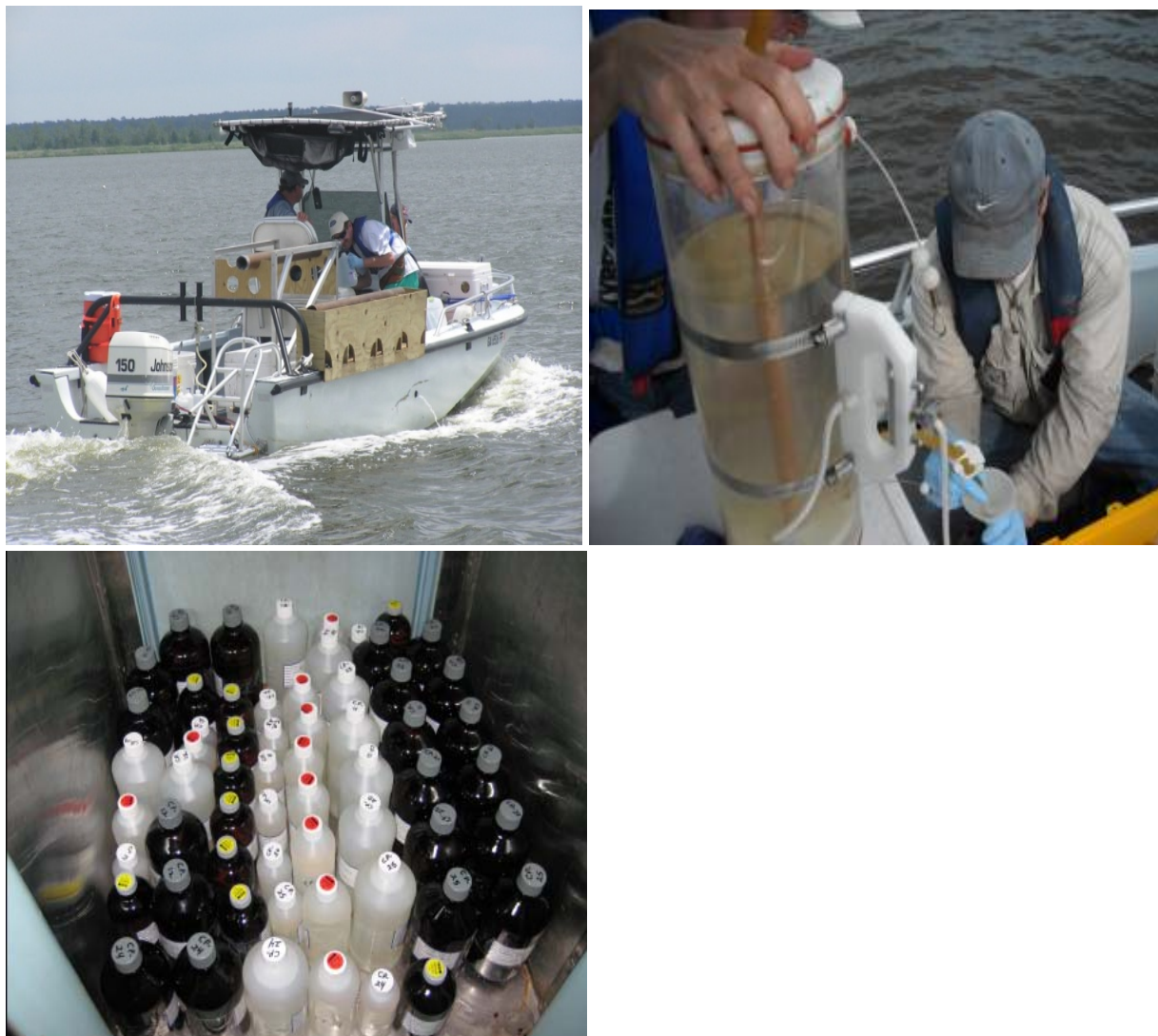
Figure 4: Support boat from which sea water samples were taken and all decontamination procedures conducted (upper left); decanting sea water from the Niskin-style sampler into a laboratory-supplied sample bottle (upper right); refrigerated sea water samples prior to shipment to analytical laboratory (lower left).