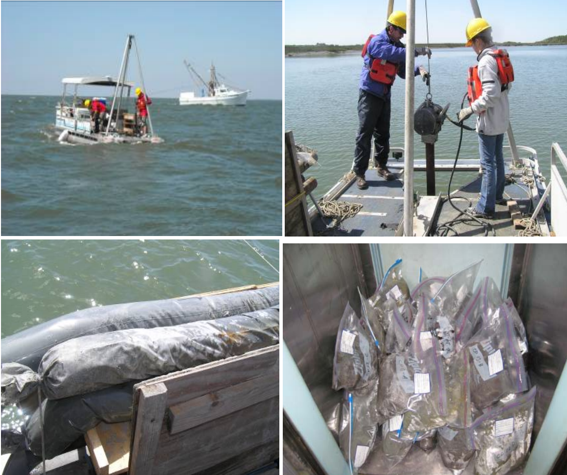
Figure 3. Pontoon boat retrofitted with vibracore (upper left); deploying the vibracore (upper right); vibracore samples in plastic liners (lower left); 1-foot vertical sections of sediment ready for shipment to analytical laboratory (lower right).