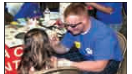
School Fair See A3