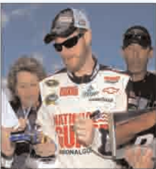
Dale Earnhardt Jr. signs autographs last weekend at Richmond International Raceway.

"I got better at my communication when I first started working with Hendrick because how they do things is different than what I've done in the past at DEI," Earnhardt said. "The team meetings after the practice, the team meetings during the week prior to the race, and the communication between the driver and the crew chief being more on a daily basis, all those things are opportunities for us to be prepared for you to just be continuously giving the crew chief and the team your information and your