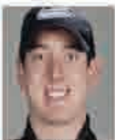
Kyle Busch

"We're trying to help each other a little bit. Joey has been a good help to me at a few places. It's been a good relationship between us three. We're all relatively young [and] we can be here for a long time. It's good to make sure we have a good relationship."